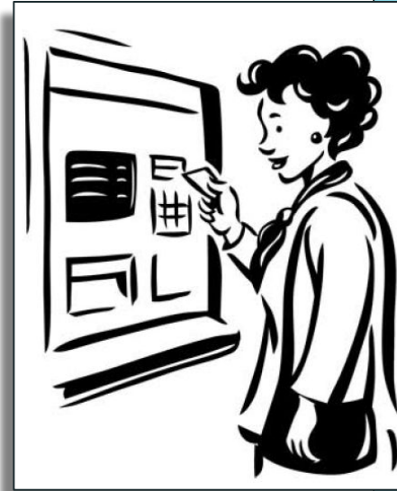
www.elcivics.com - Checking Account

Kyle wants to open a joint checking account in both of their names, but Rosa said no. She likes having her own bank accounts. She has a savings account and a checking account, and she doesn't want another account. Kyle is frugal with his money, and if she opens a bank account with him, he might ask her to explain why she withdrew money from the account. He might even ask her why she didn't deposit enough money into their account. Kyle thinks that Rosa doesn't trust him. He said they can't get married if she doesn't trust him.