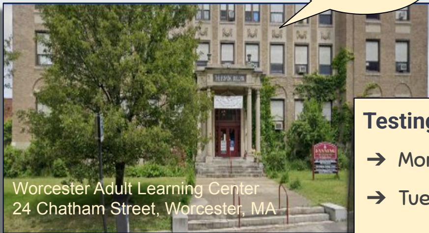
Worcester Adult Learning Center 24 Chatham Street, Worcester, MA